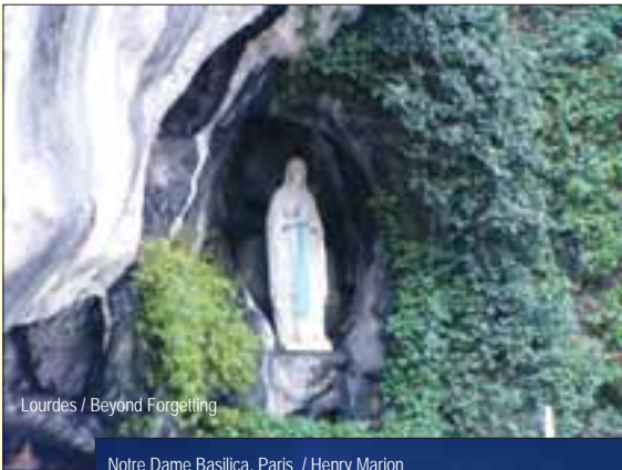
Lourdes / Beyond Forgetting