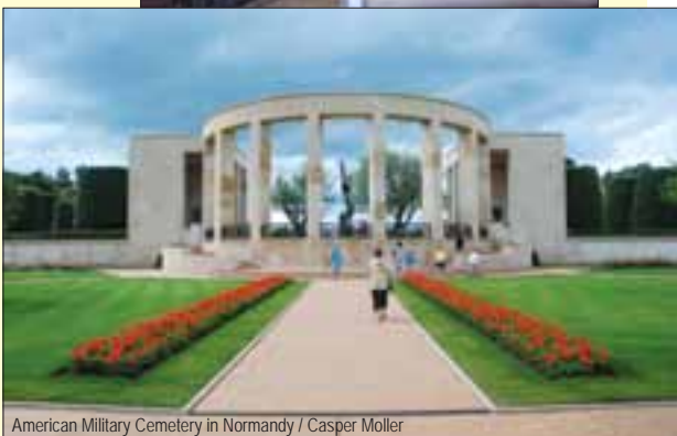
American Military Cemetery in Normandy / Casper Moller