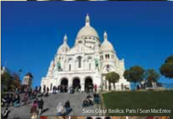
Sacre Coeur Basilica, Paris / Sean MacEntee